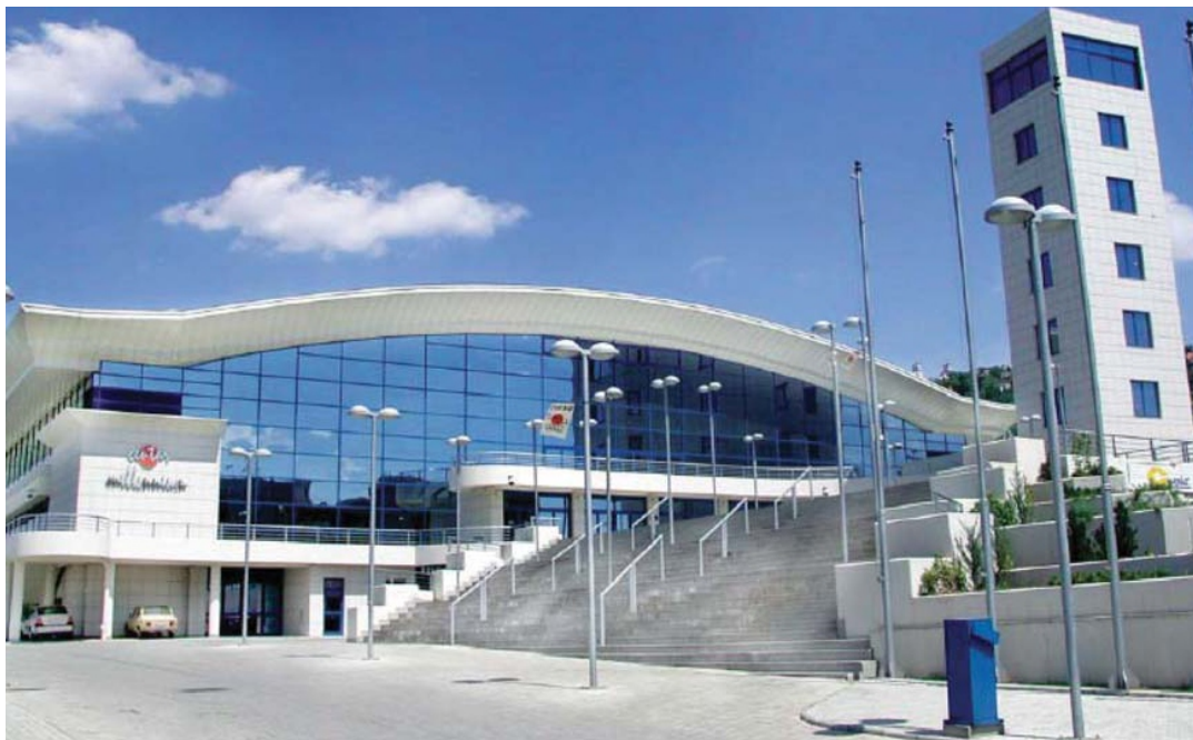
Centar Millennium A D