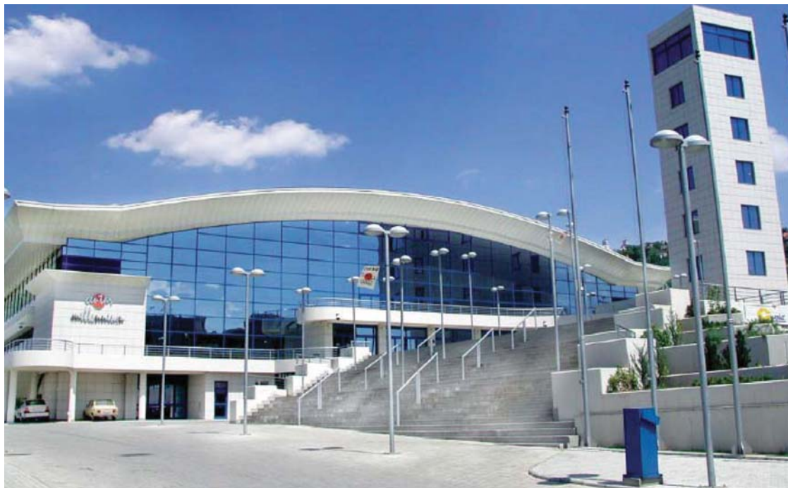
Centar Millennium A D